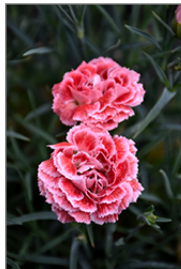
Coral Reef Pinks flowers

This is a relatively low maintenance plant, and is best cleaned up in early spring before it resumes active growth for the season. It is a good choice for attracting bees and butterflies to your yard, but is not particularly attractive to deer who tend to leave it alone in favor of tastier treats. It has no significant negative characteristics.