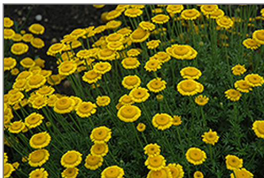
Charme Marguerite Daisy flowers

Charme Marguerite Daisy is recommended for the following landscape applications;