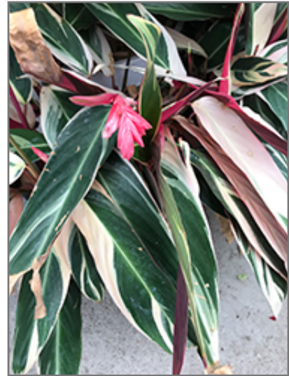
Tricolor Stromanthe flowers

This plant does best in full sun to partial shade. It prefers to grow in average to moist conditions, and shouldn't be allowed to dry out. It is not particular as to soil pH, but grows best in rich soils. It is somewhat tolerant of urban pollution. This is a selected variety of a species not originally from North America. It can be propagated by division; however, as a cultivated variety, be aware that it may be subject to certain restrictions or prohibitions on propagation.