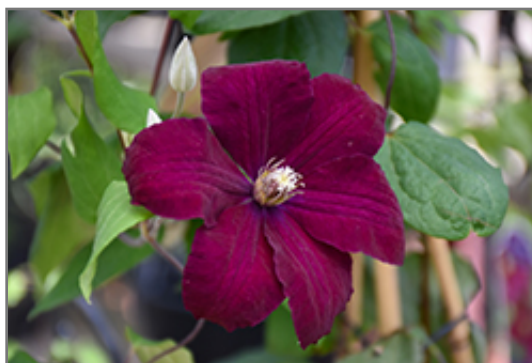
Rouge Cardinal Clematis flowers