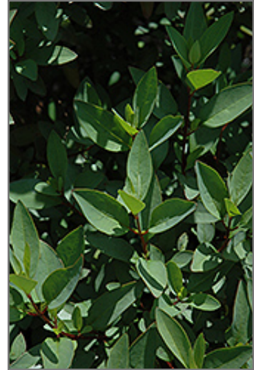
Thyallis foliage

* This is a 'special order' plant - contact store for details