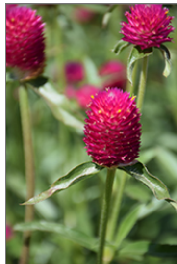
Qis Carmine Gomphrena flowers

Qis Carmine Gomphrena is recommended for the following landscape applications;