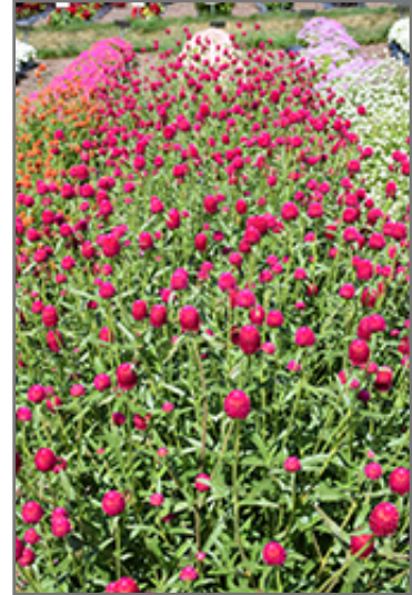
Qis Carmine Gomphrena in bloom

* This is a 'special order' plant - contact store for details