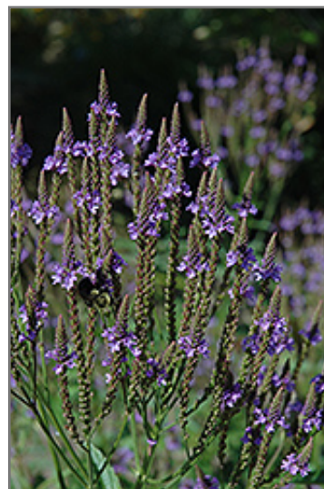
Blue Verbena flowers

Blue Verbena is recommended for the following landscape applications;