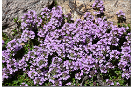
Purple Carpet Creeping Thyme flowers

This plant will require occasional maintenance and upkeep, and is best cleaned up in early spring before it resumes active growth for the season. Deer don't particularly care for this plant and will usually leave it alone in favor of tastier treats. Gardeners should be aware of the following characteristic(s) that may warrant special consideration;