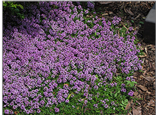
Purple Carpet Creeping Thyme in bloom