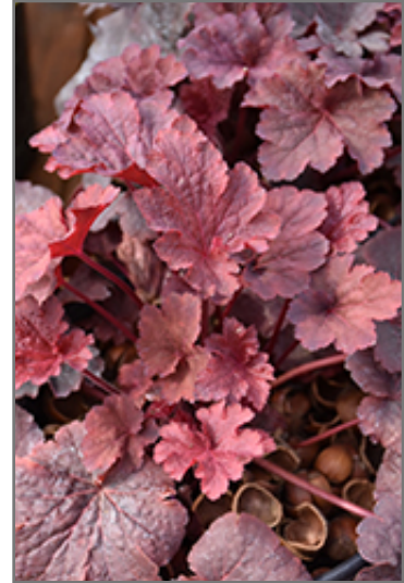
Cajun Fire Coral Bells foliage

Cajun Fire Coral Bells is recommended for the following landscape applications;