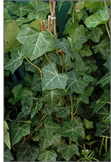
Thorndale Ivy foliage

Thorndale Ivy is recommended for the following landscape applications;