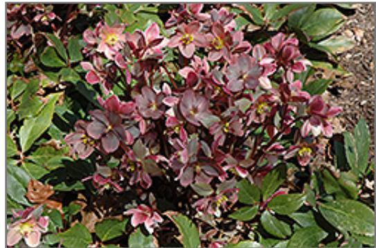
Pink Frost Hellebore in bloom