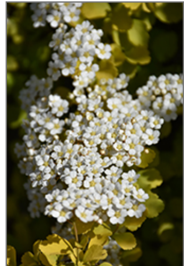
Glow Girl Birch Leaf Spirea flowers