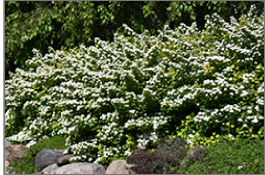
Glow Girl Birch Leaf Spirea in bloom

Glow Girl Birch Leaf Spirea is recommended for the following landscape applications;