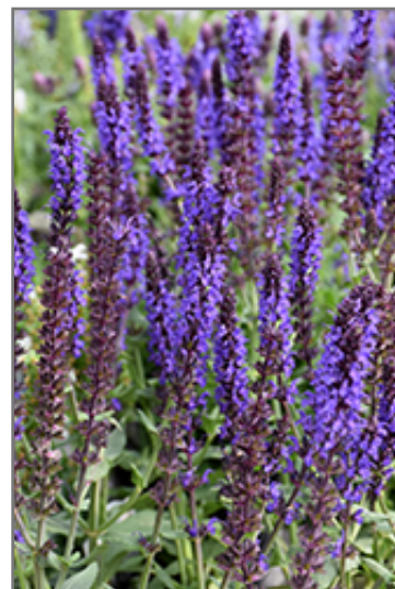
Lyrical Blues Meadow Sage flowers

This is a relatively low maintenance plant, and is best cleaned up in early spring before it resumes active growth for the season. It is a good choice for attracting butterflies and hummingbirds to your yard, but is not particularly attractive to deer who tend to leave it alone in favor of tastier treats. It has no significant negative characteristics.