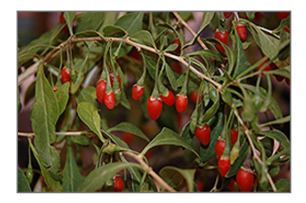
Sweet Lifeberry Goji Berry fruit