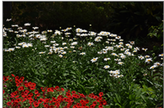
Brightside Shasta Daisy in bloom