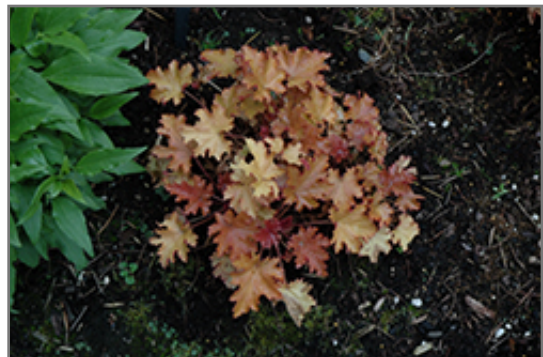
Zipper Coral Bells