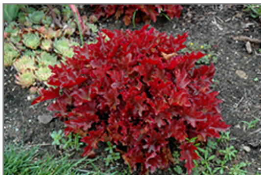
Dolce Cinnamon Curls Coral Bells