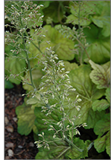
Delta Dawn Coral Bells flowers

Delta Dawn Coral Bells is recommended for the following landscape applications;