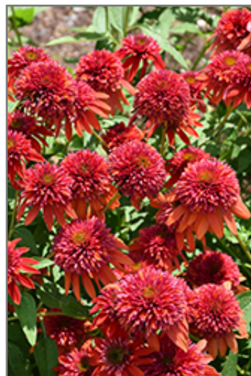
Double Scoop Orangeberry Coneflower flowers

Double Scoop Orangeberry Coneflower is recommended for the following landscape applications;