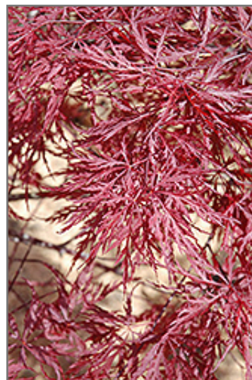
Red Dragon Japanese Maple foliage