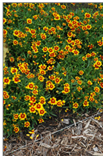
Lil' Bang Daybreak Tickseed in bloom