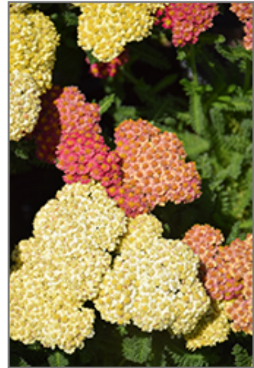
Desert Eve Terracotta Yarrow flowers

Desert Eve Terracotta Yarrow is recommended for the following landscape applications;