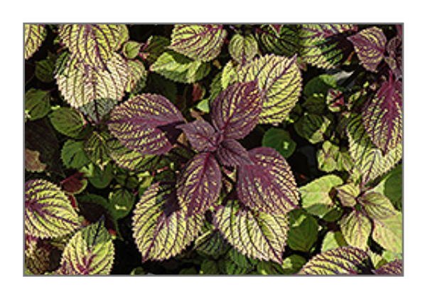
Fishnet Stockings Coleus foliage

Fishnet Stockings Coleus will grow to be about 30 inches tall at maturity, with a spread of 16 inches. When grown in masses or used as a bedding plant, individual plants should be spaced approximately 12 inches apart. Although it's not a true annual, this fast-growing plant can be expected to behave as an annual in our climate if left outdoors over the winter, usually needing replacement the following year. As such, gardeners should take into consideration that it will perform differently than it would in its native habitat.