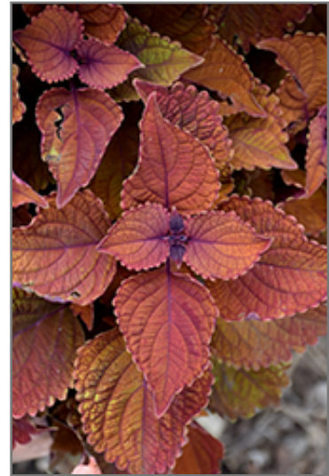
Wall Street Coleus foliage