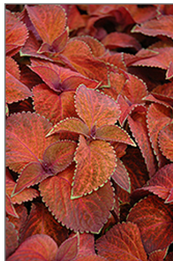
Wizard Sunset Coleus foliage

Wizard Sunset Coleus is recommended for the following landscape applications;