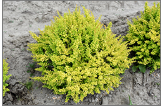
Sunsation Japanese Barberry

Sunsation Japanese Barberry is recommended for the following landscape applications;