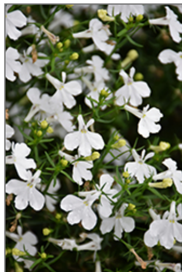
Bella Bianca Lobelia flowers