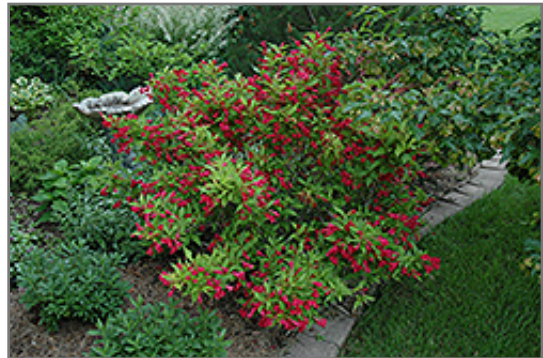
Red Prince Weigela in bloom