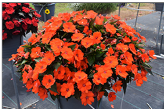
SunPatiens Compact Electric Orange New Guinea Impatiens in bloom

SunPatiens Compact Electric Orange New Guinea Impatiens is a fine choice for the garden, but it is also a good selection for planting in outdoor containers and hanging baskets. It can be used either as 'filler' or as a 'thriller' in the 'spiller-thriller-filler' container combination, depending on the height and form of the other plants used in the container planting. It is even sizeable enough that it can be grown alone in a suitable container. Note that when growing plants in outdoor containers and baskets, they may require more frequent waterings than they would in the yard or garden.