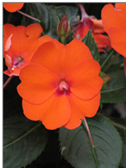
SunPatiens Compact Electric Orange New Guinea Impatiens flowers

This plant will require occasional maintenance and upkeep, and should not require much pruning, except when necessary, such as to remove dieback. It is a good choice for attracting bees and butterflies to your yard. It has no significant negative characteristics.