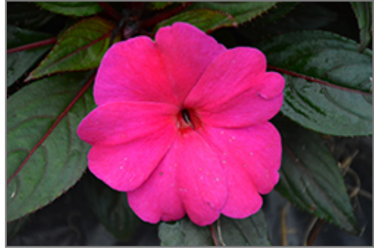
Magnum Blue New Guinea Impatiens flowers

Magnum Blue New Guinea Impatiens is recommended for the following landscape applications;