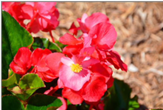
Whopper Rose Green Leaf Begonia flowers

Whopper Rose Green Leaf Begonia is an herbaceous annual with a mounded form. Its medium texture blends into the garden, but can always be balanced by a couple of finer or coarser plants for an effective composition.