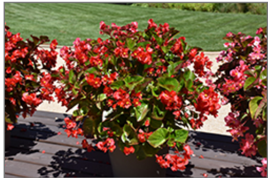
Whopper Red Green Leaf Begonia flowers