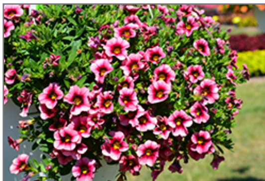
Hula Hot Pink Calibrachoa flowers

Hula Hot Pink Calibrachoa is recommended for the following landscape applications;