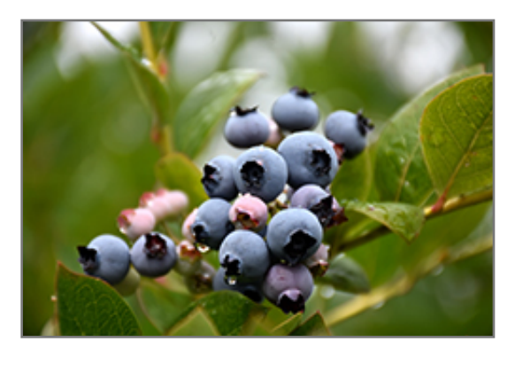
Patriot Blueberry fruit