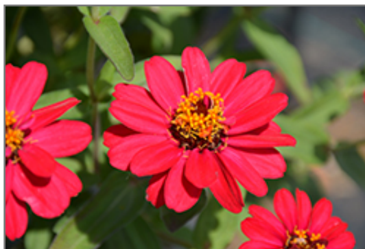
Profusion Double Hot Cherry Zinnia flowers