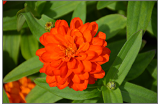
Profusion Double Fire Zinnia flowers