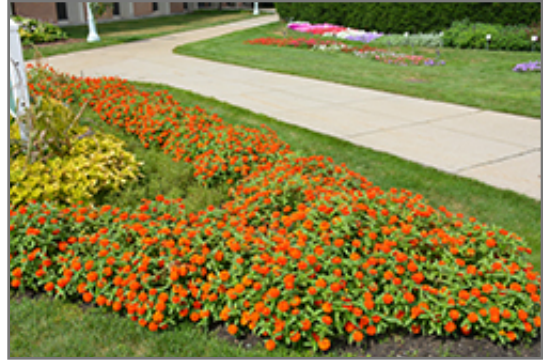
Profusion Double Fire Zinnia in bloom

Profusion Double Fire Zinnia is a fine choice for the garden, but it is also a good selection for planting in outdoor containers and hanging baskets. It is often used as a 'filler' in the 'spiller-thriller-filler' container combination, providing a mass of flowers against which the larger thriller plants stand out. Note that when growing plants in outdoor containers and baskets, they may require more frequent waterings than they would in the yard or garden.