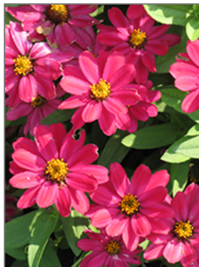
Profusion Cherry Zinnia flowers