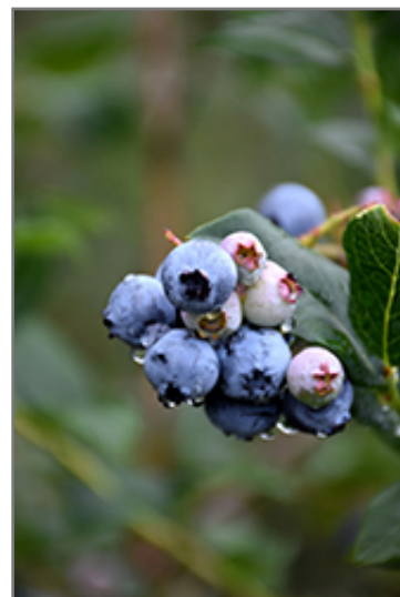
Chippewa Blueberry fruit

Chippewa Blueberry features dainty clusters of white bell-shaped flowers with shell pink overtones hanging below the branches in mid spring. It has green deciduous foliage. The glossy oval leaves turn an outstanding orange in the fall. It features an abundance of magnificent blue berries in mid summer.