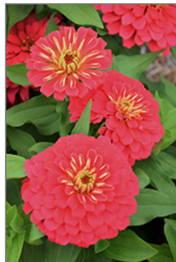
Magellan Coral Zinnia flowers