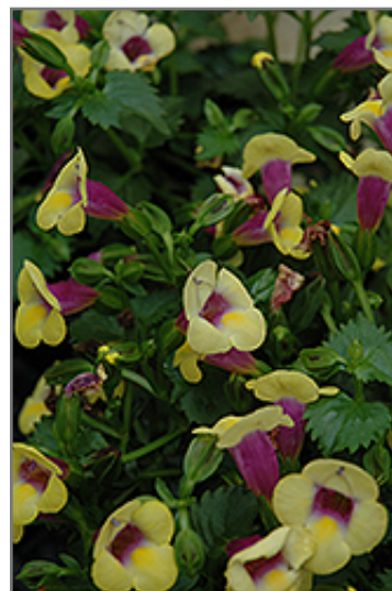
Yellow Moon Torenia flowers

Yellow Moon Torenia is recommended for the following landscape applications;