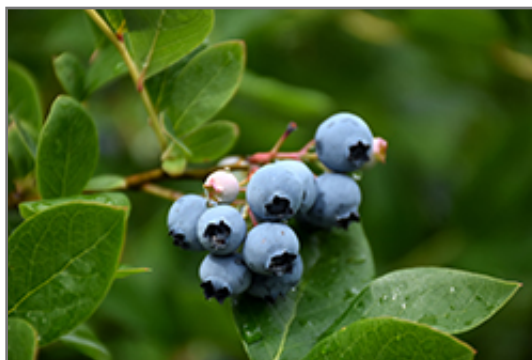
Northcountry Blueberry fruit

Northcountry Blueberry features dainty clusters of white bell-shaped flowers with shell pink overtones hanging below the branches in mid spring. It has green deciduous foliage. The glossy oval leaves turn an outstanding scarlet in the fall. It features an abundance of magnificent blue berries in mid summer.