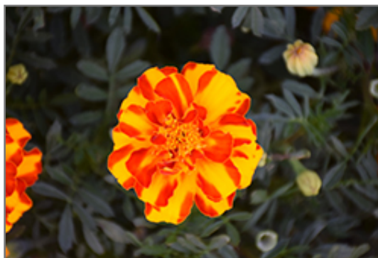
Durango Bolero Marigold flowers