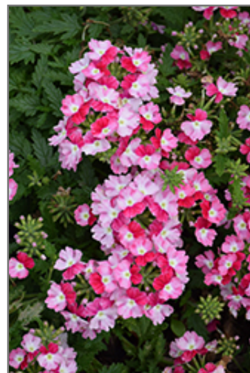
Lanai Twister Red Verbena flowers

Lanai Twister Red Verbena is recommended for the following landscape applications;