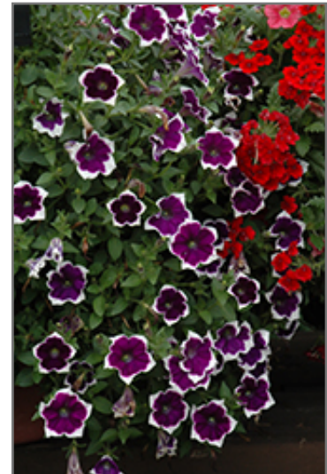
Cascadias Rim Violet Petunia flowers