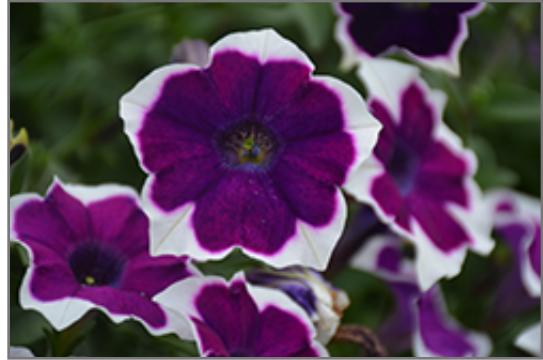
Cascadias Rim Violet Petunia flowers

Cascadias Rim Violet Petunia is recommended for the following landscape applications;