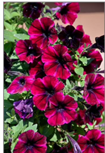
Sweetunia Johnny Flame Petunia flowers