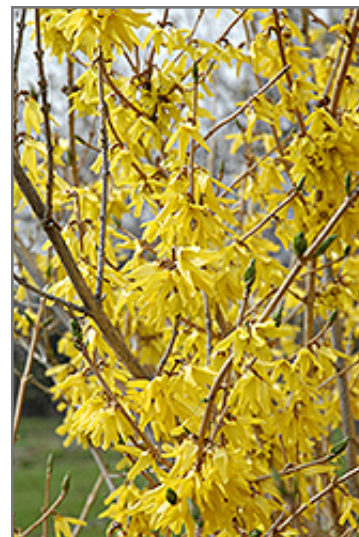
Northern Gold Forsythia flowers