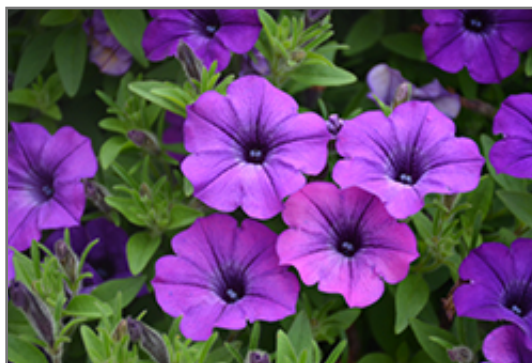
Supertunia Indigo Charm Petunia flowers

Supertunia Indigo Charm Petunia is recommended for the following landscape applications;