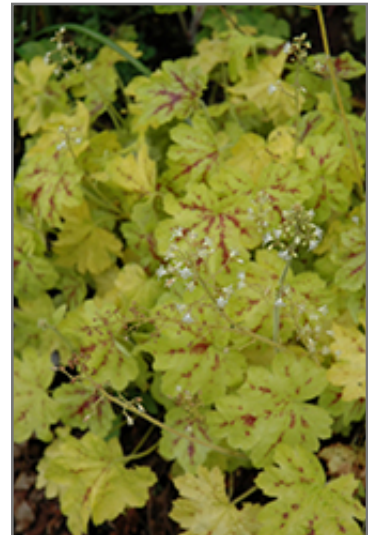
Solar Power Foamy Bells flowers