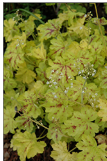
Solar Power Foamy Bells flowers