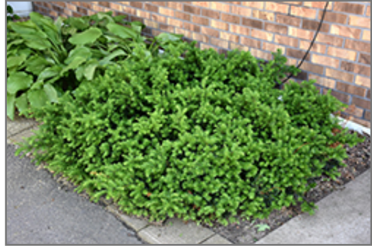
Emerald Spreader Yew

This shrub performs well in both full sun and full shade. However, you may want to keep it away from hot, dry locations that receive direct afternoon sun or which get reflected sunlight, such as against the south side of a white wall. It does best in average to evenly moist conditions, but will not tolerate standing water. It is not particular as to soil type or pH. It is highly tolerant of urban pollution and will even thrive in inner city environments, and will benefit from being planted in a relatively sheltered location. Consider applying a thick mulch around the root zone in winter to protect it in exposed locations or colder microclimates. This is a selected variety of a species not originally from North America, and parts of it are known to be toxic to humans and animals, so care should be exercised in planting it around children and pets.