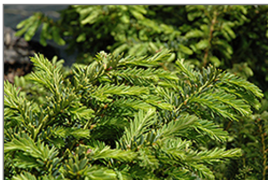
Emerald Spreader Yew foliage