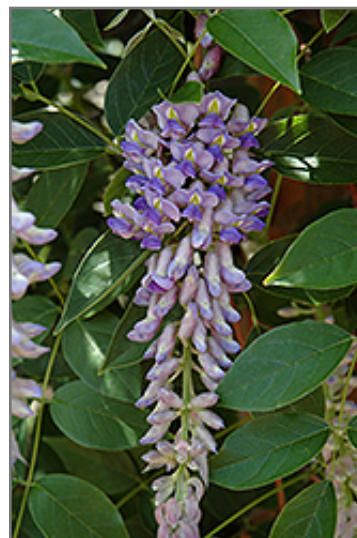
Summer Cascade Wisteria flowers

This is a high maintenance woody vine that will require regular care and upkeep, and should only be pruned after flowering to avoid removing any of the current season's flowers. It is a good choice for attracting hummingbirds to your yard, but is not particularly attractive to deer who tend to leave it alone in favor of tastier treats. Gardeners should be aware of the following characteristic(s) that may warrant special consideration;